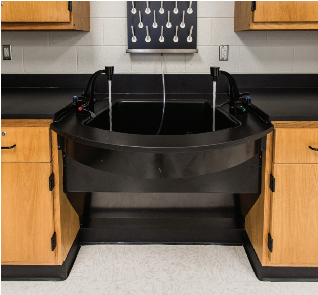
Synergy Sink (ADA) in perimeter casework