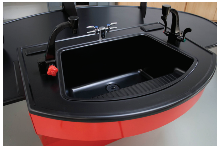
Synergy Sink in Axis Infinity Table