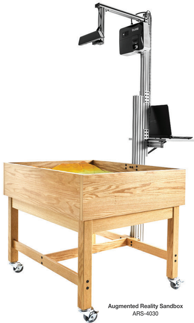
Augmented Reality Sandbox ARS-4030