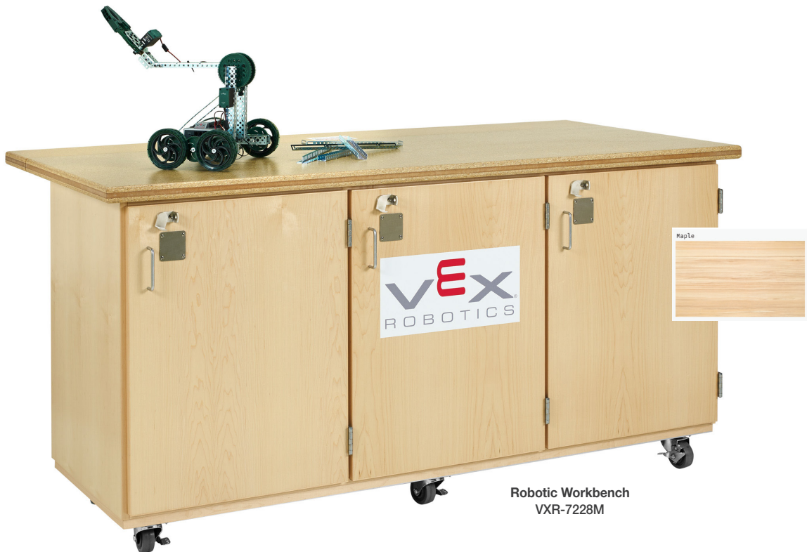
Robotic Workbench VXR-7228M